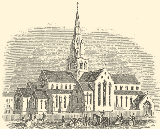
ST. BARNABAS CATHOLIC CHURCH, NOTTINGHAM.

(Where an associated charity is involved the amount is passed on to that charity).